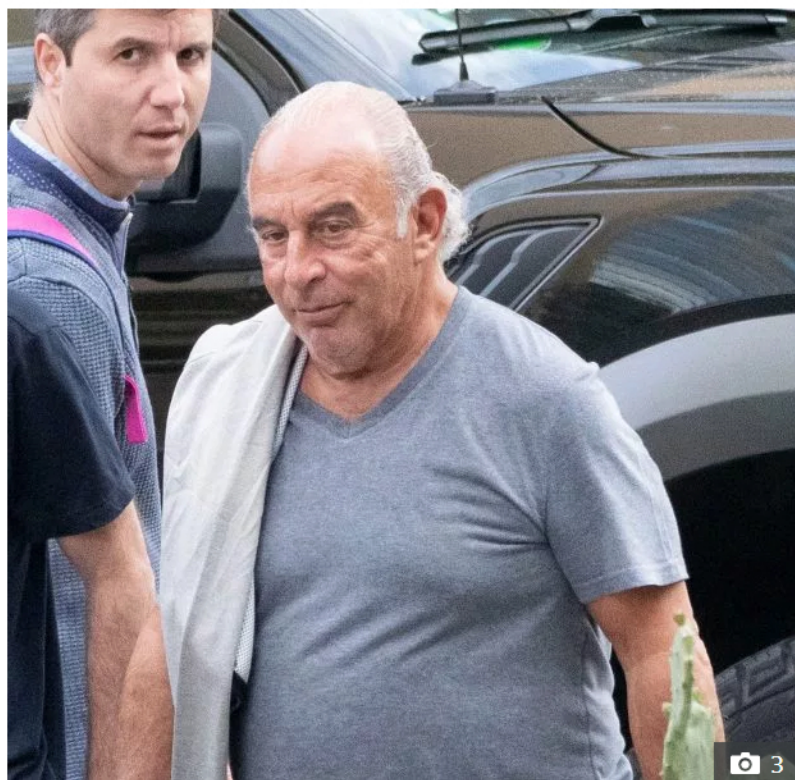
Sir Philip Green was yesterday left pleading with landlords to help save his retail empire as his rescue plans hung in the balance

As a key vote on his Arcadia Group's future was adjourned, it emerged the tycoon has hired sex assault suspect Kevin Spacey's lawyer to fight his own groping charges in the US .