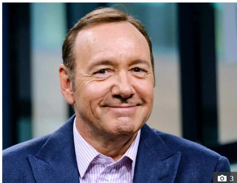
It has emerged Green has hired sex assault suspect Kevin Spacey's lawyer to fight his own groping charges in the US

Green's drastic restructuring of Arcadia will pave the way for nearly 50 store closures at brands including Topshop and Miss Selfridge.