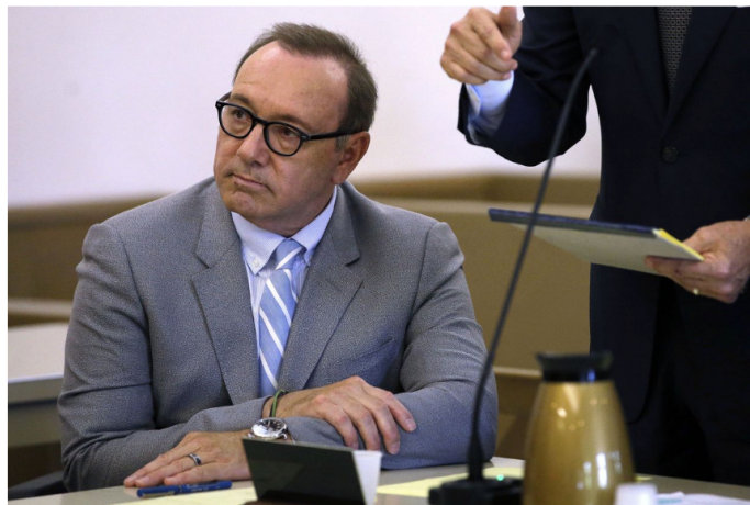
Kevin Spacey at the pretrial hearing in Nantucket District Court on Monday

Star is accused of groping young man at a Nantucket bar in 2016, a charge he denies