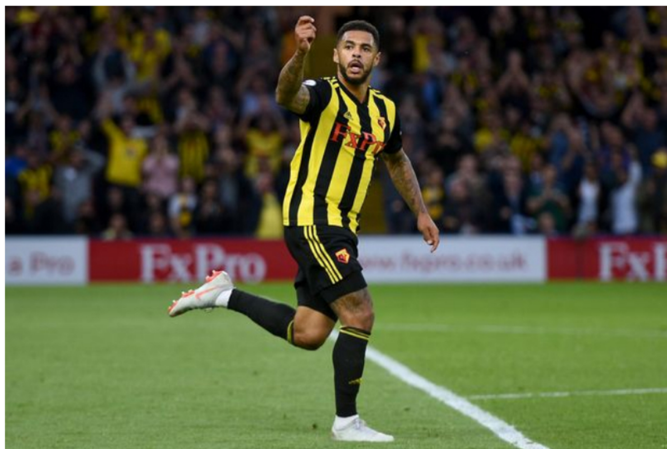
Watford's Andre Gray